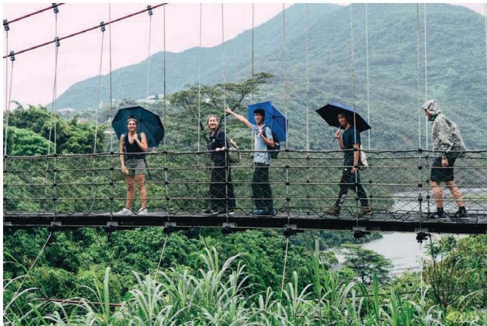
UW students walking across a suspension bridge in the Taiwan Indigenous Culture Park in Pingtung during a 2019 Study Abroad Program in Taiwan.

The Taiwan Studies Program at the University of Washington (UW) was established in 2017 to promote research and education on Taiwan society and culture. Located in the Henry M. Jackson School of International Studies, the Program is the newest addition to long-standing programs in China, Japan, and Korea Studies, and a host of other global programs ranging from Jewish Studies to Latin American and Caribbean Studies. With graduate and undergraduate courses, regular academic lectures, and public roundtables, we serve as a global center of knowledge for students, scholars, and the public. By working with UW's Taiwanese student organizations, the growing ranks of UW Taiwanese alumni, and the regional Taiwanese community, the Program is also an important cultural and academic hub for the Taiwanese diaspora.