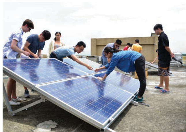
Students in Exploring Environmental and Social Resilience study abroad course assembled a solar PV module and learned about the technical aspect of solar energy generation at the National Changhua University of Education's Renewal Energy Research Center.