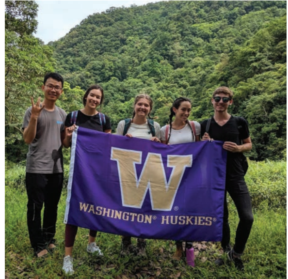
UW students visiting Sanpuku tea farm in Pinglin District of New Taipei City during a 2019 Study Abroad program in Taiwan.