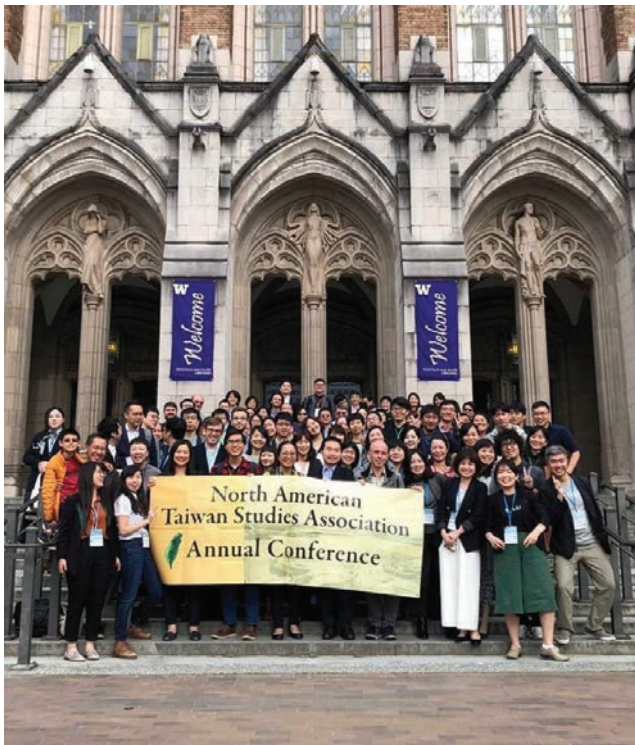
Attendees of the North American Taiwan Studies Association annual meeting, hosted by the Taiwan Studies Program at the University of Washington in May 2019.