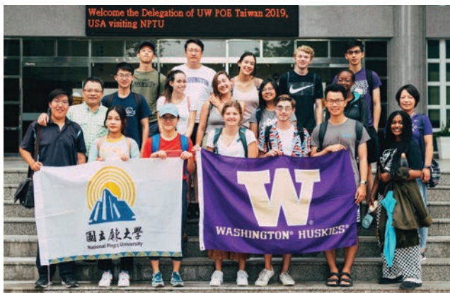
UW study abroad students along with students from National Pingtung University before departing on field trips exploring Hakka and indigenous communities in southern Taiwan.

Through the UW East Asia Resource Center and the World Affairs Council's Global Classroom Program, we have offered a workshop for Seattle area secondary and community college educators on how Taiwan can be used to understand major historical and social science issues.