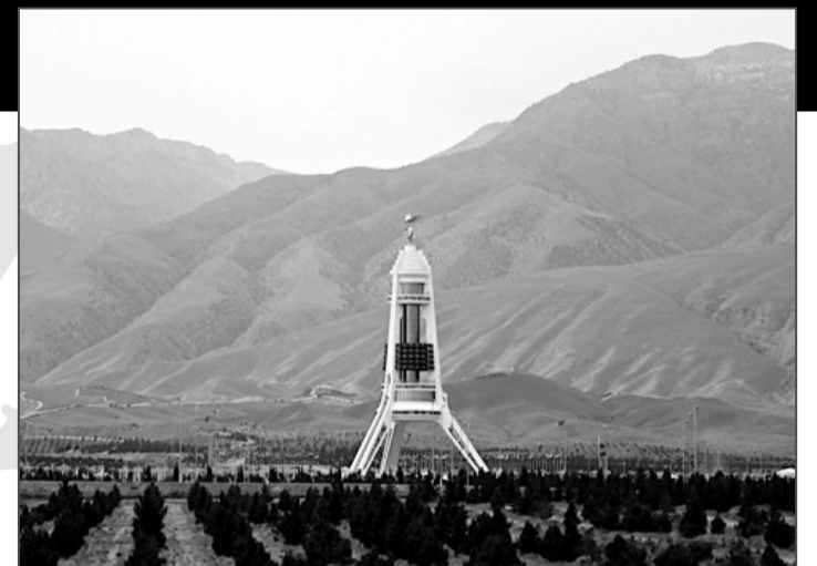
The Arch of Neutrality in the city of Ashgabat was a 75-meter rocket-shaped tower topped with a gold statue of Niyazov, which rotated throughout the day so that his face is always basking in the sun. It was demolished in November and December, 2013.

Only during nationally orchestrated public events do crowds gather in these public spaces. Even then, the crowds are reported to consist largely of invited