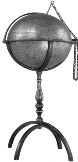
Brass globe, Iran, 1430

Fellows from previous summer sessions have found this professional development opportunity particularly valuable. A participant from last summer said, "This seminar has given