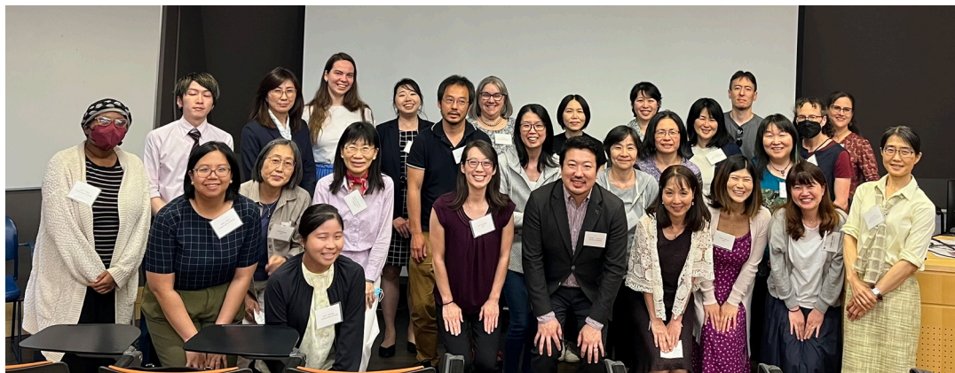
The 4th Northwest Conference on Japanese Pedagogy was held May 20-21, 2023. Thirty-two participants included graduate students, K-12 teachers, college instructors from the Pacific Northwest region, and presenters from other parts of the country.