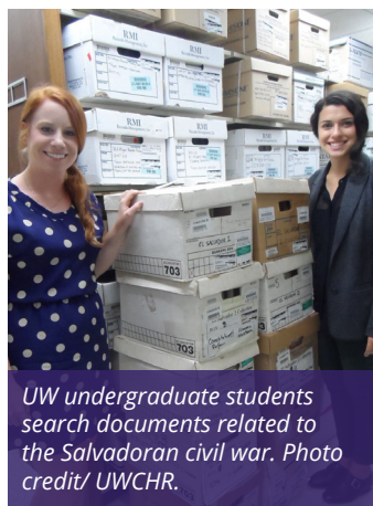
UW undergraduate students search documents related to the Salvadoran civil war.

Projects under the Rethinking Punishment initiative work to share stories of people who have served or are serving long prison sentences, and to find new ways to frame problems of violence and mass incarceration in order to allow politicians and the public to consider meaningful reforms of the legal system.