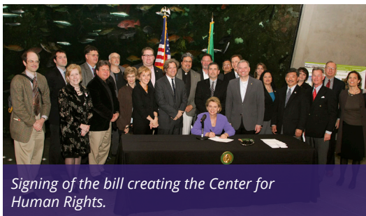
Signing of the bill creating the Center for Human Rights.

of UW researchers, but the Center's outreach and educational efforts introduce human rights issues to new audiences. This collaboration ensures that UWCHR research has an on-the-ground impact, placing us at the nexus of education, engagement, and change.