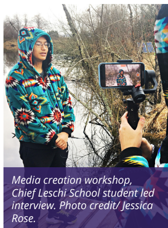
Media creation workshop, Chief Leschi School student led interview.

Unfinished Sentences is an initiative of the UWCHR that aims to document and share stories of survivors of crimes against humanity committed in the context of El Salvador's armed conflict, and to support Salvadoran efforts for truth and accountability.