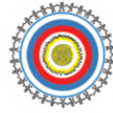
RAIPON Russian Association of Indigenous Peoples of the North