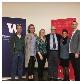
Tony Penikett visits UW—November 2019