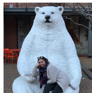
Exchange program manager visits B.C.—November 2019