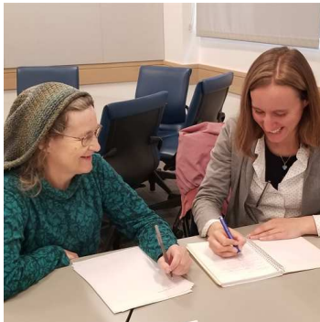
Inuktitut training at the University of Washington