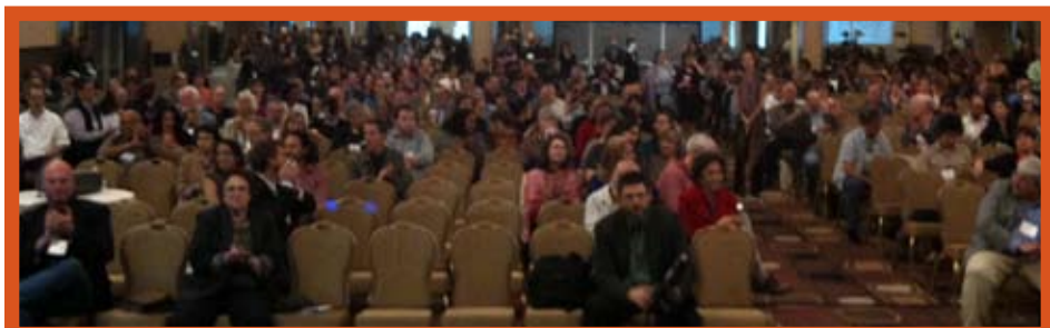
"Board's-eye view" of the membership meeting at SEM 2010 in LA