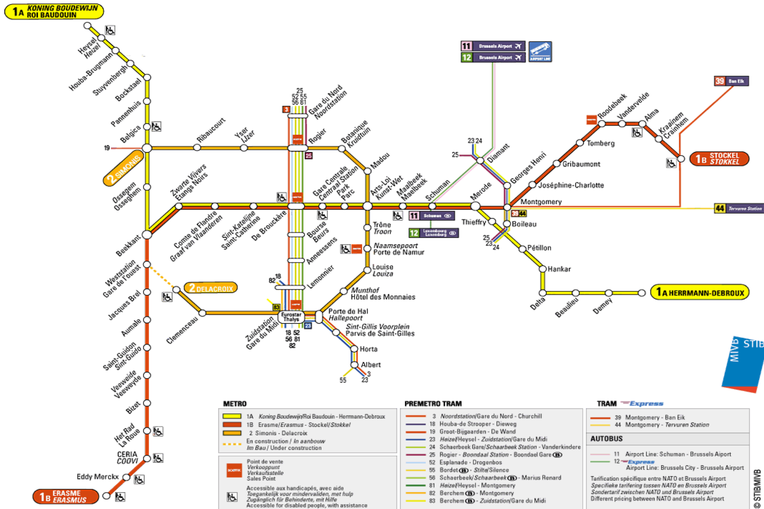
Brussels' metro system map. The Delta station is on the 1A line (yellow).